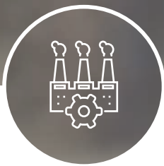
Machines and equipment